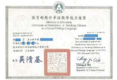
Professional certified teachers