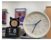
choose your own class time