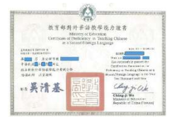
Professional certified teachers