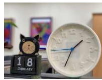
choose your own class time