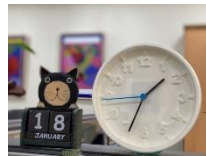
Customized flexible schedule